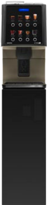
Base cabinet kit Ready to install a coin validator.

It is also the perfect solution for a coffee service in convenience stores as well as for hotels, where breakfast needs to be good but also fast. It offers a pleasurable experience with an attractive, simple and functional design.