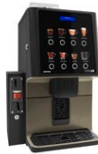
Validator module kit Ready to install a coin validator.